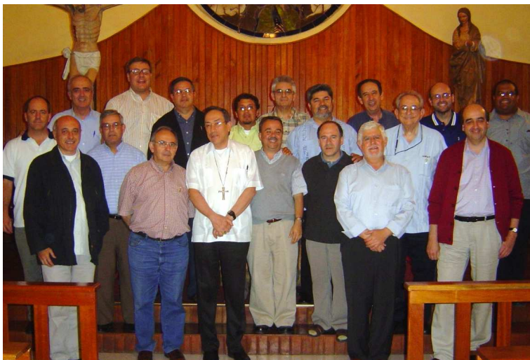
The Piarist Major Superiors of America, with Card. O.R. Maradiaga

The meeting was enriching for all the participants. They had the opportunity to visit