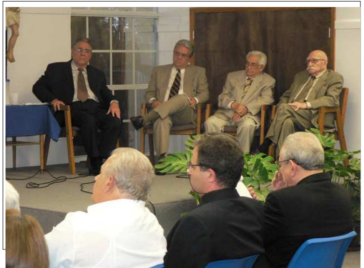
Some of the attendants to the Celebration in SEPI