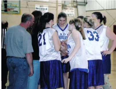
The Piarist Lady Knights

The Piarist School has introduced a new sport, girl's volleyball. Practice began on July 15th for the Volley Knights,